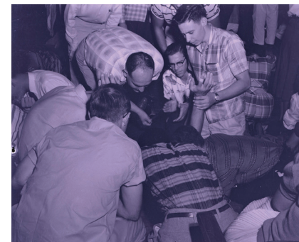
SBI Students in devotional

power of God came upon me," he shares. "I felt a divine call to preach the gospel."