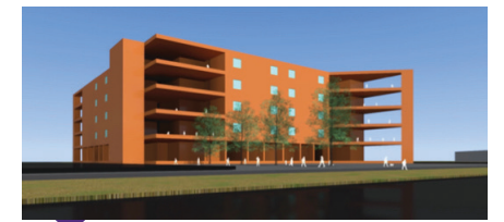
New Dormitory, Architectural renderings

As we embark on this exciting new chapter with our recent name change, we firmly believe that God will bring an influx of like-minded students, each eager to be equipped spiritually, academically, professionally, and cross-culturally for their God-given careers and callings. This period of transformation is not just about a name but about a renewed dedication to our vision and mission.