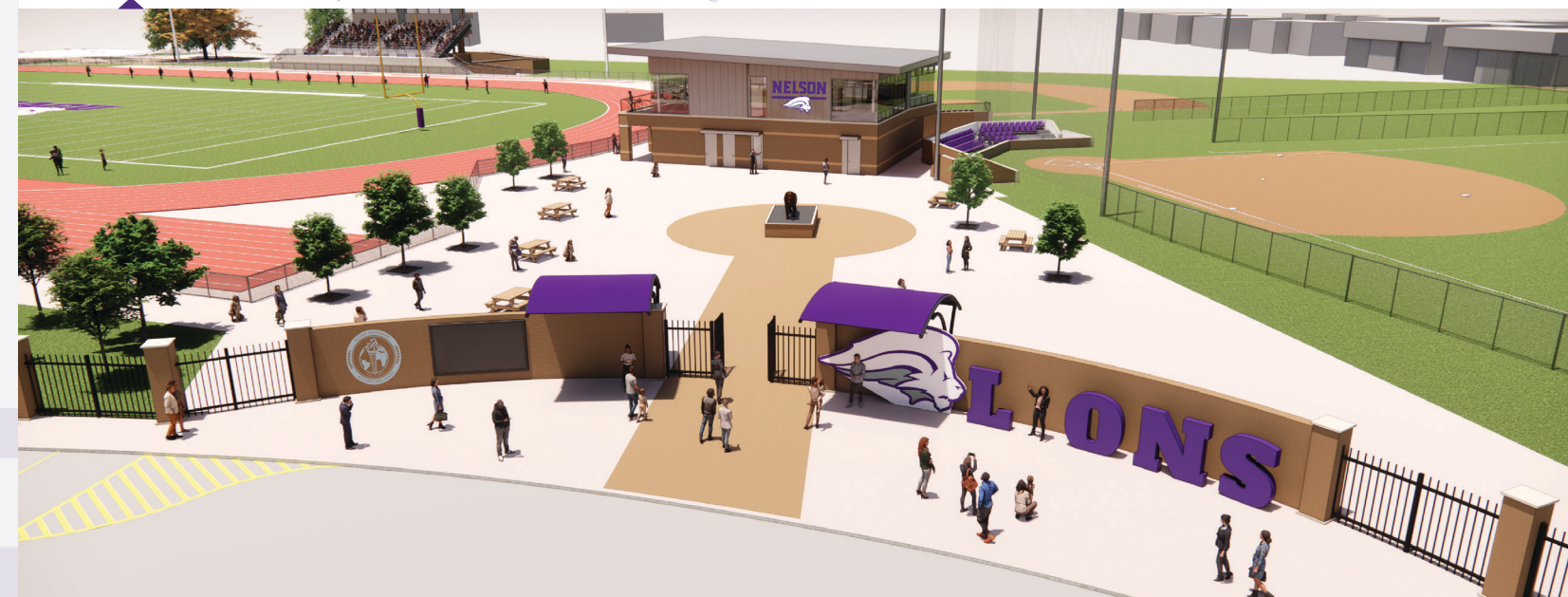
Lions Athletic Complex, Plaza Entrance. Architectural renderings.