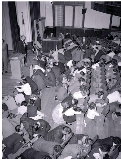
SBI Students in chapel